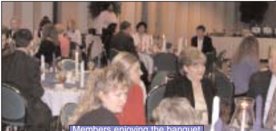
Members enjoying the banquet